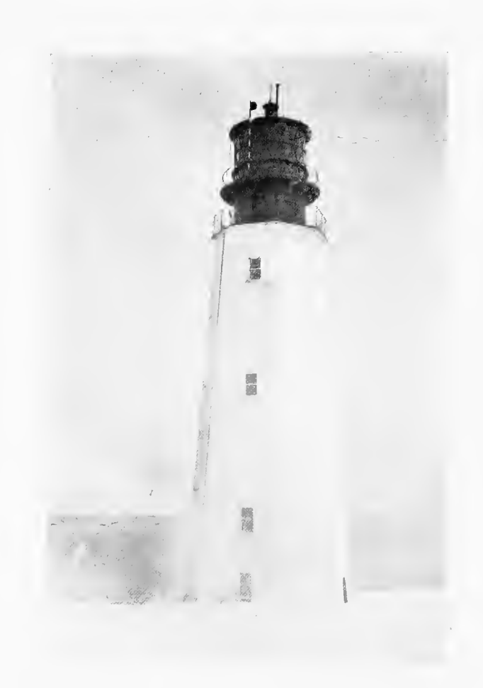
CAPE HENLOPEN LIGHTHOUSE.