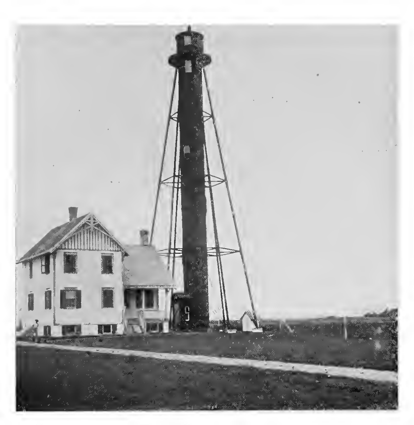
GREEN HILL LIGHTHOUSE.