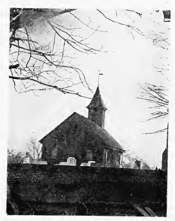
ST. PETER'S, 1808 (Second Building)