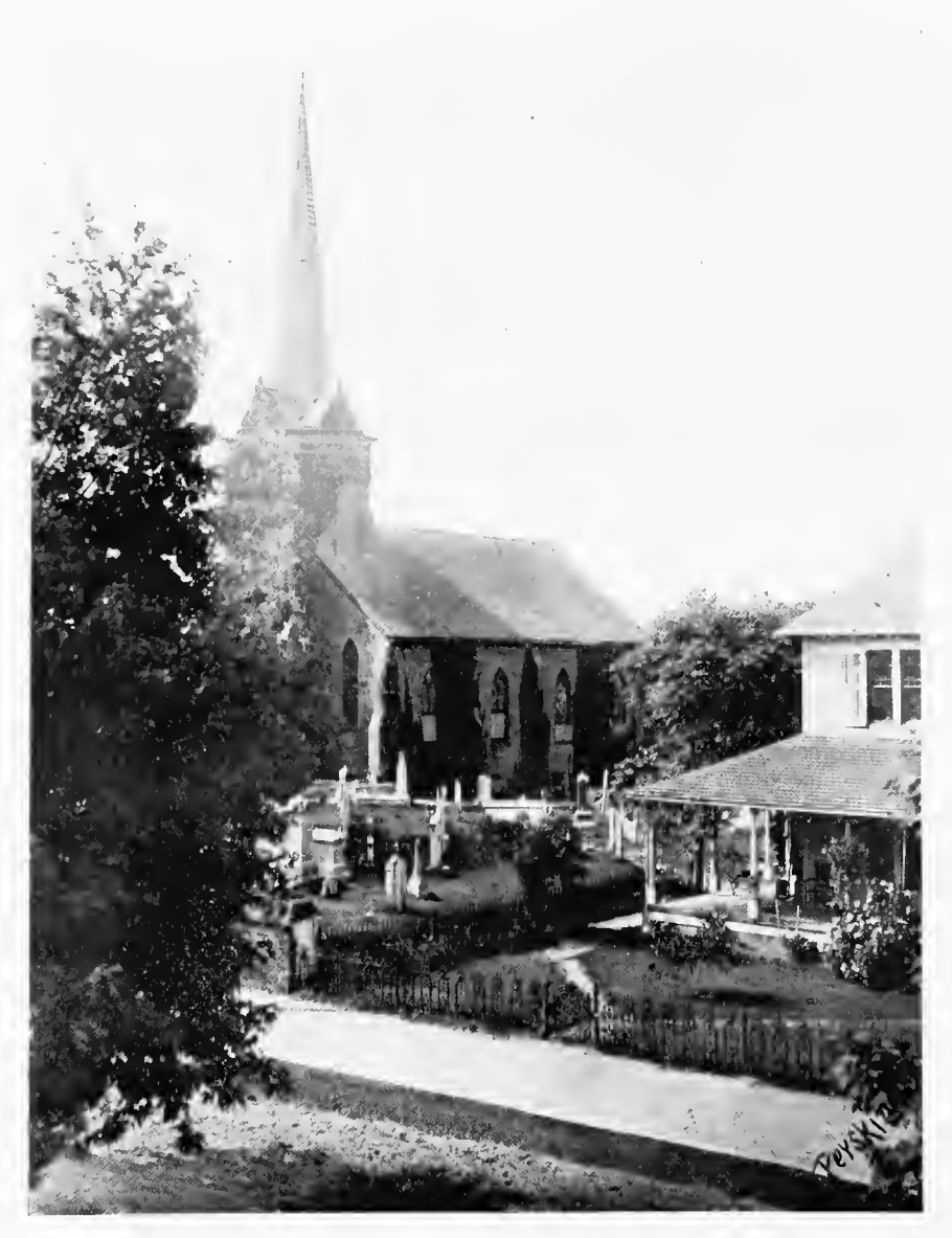
ST. PETER'S CHURCH.