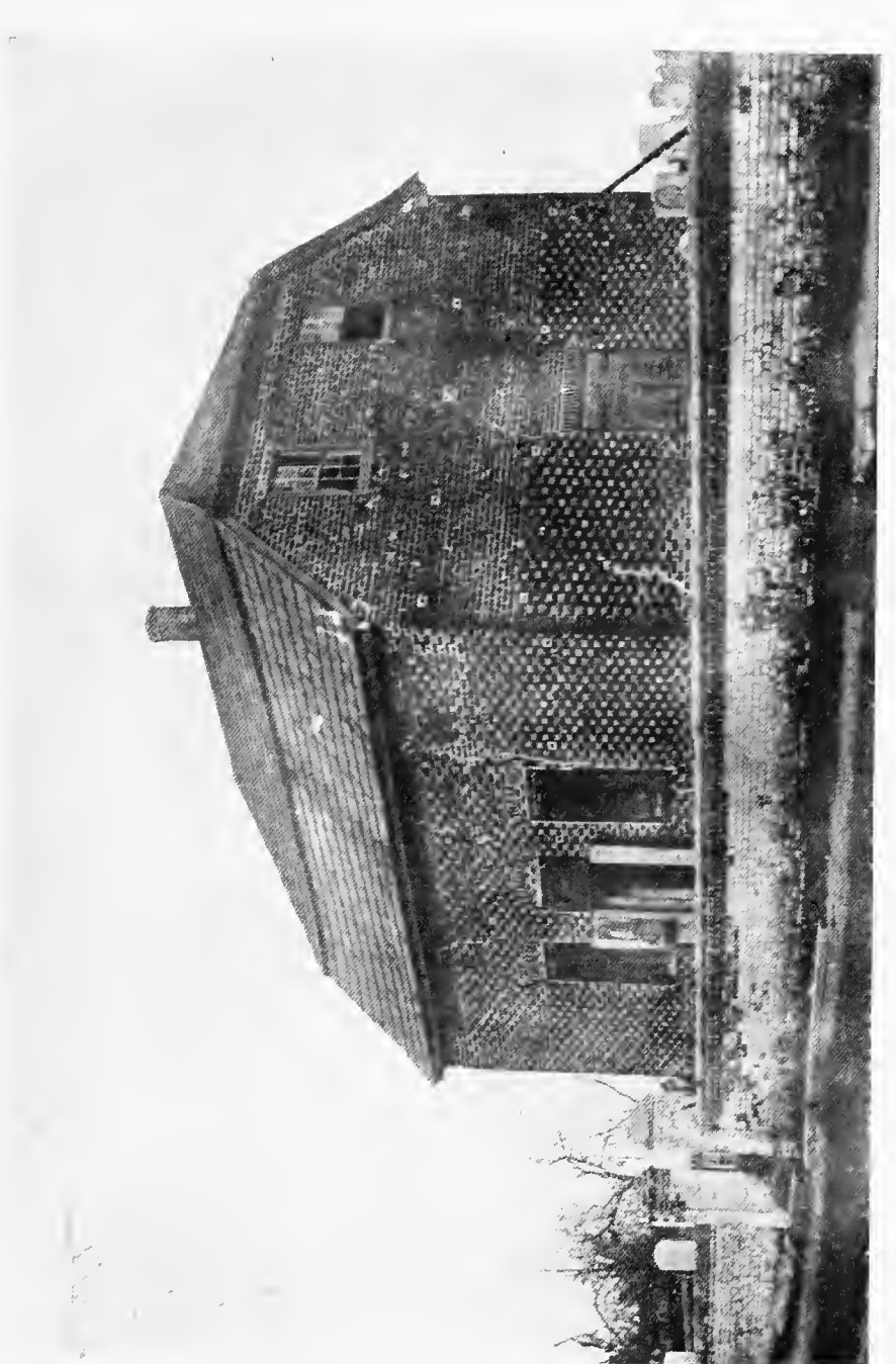
OLD PRESBYTERIAN CHURCH, 1727.